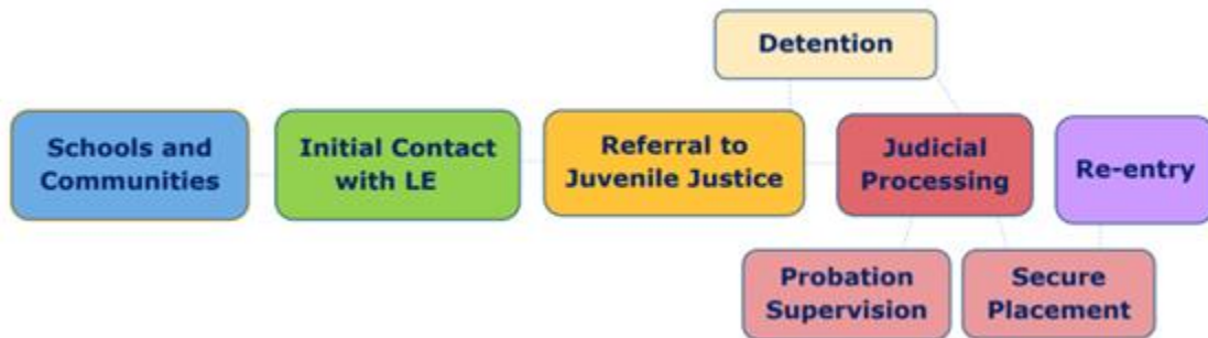
Figure 2. The Youth SIM

Visit the TA Center SIM landing page to learn more about the SIM or view completed county SIM reports.